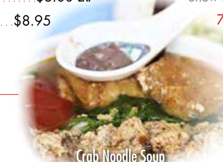
Crab Noodle Soup