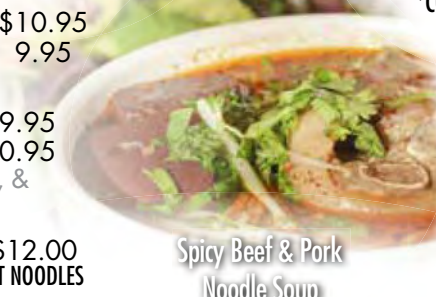
Spicy Beef & Pork Noodle Soup

16 iHOT POT SPICY SEAFOOD (LAU THAI) $48.00 Spicy Herbs, Shrimp, Squid, Scallop, & Assorted Vegetables