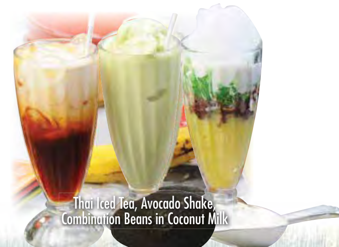
Thai Iced Tea, Avocado Shake, Combination Beans in Coconut Milk