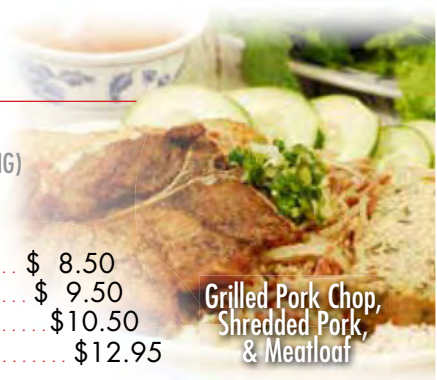
Grilled Pork Chop, Shredded Pork, & Meatloaf

ADD 1 EGG (SUNNY SIDE UP) $1.00 SUB BROWN RICE $2.00 SUB FRIED RICE $2.50 *COMBINING SAME ITEMS SHRIMP OR PORK CHOP UPCHARGE $2.00