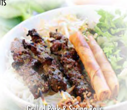
Grilled Pork & Spring Rolls

*COMBINING SAME ITEMS SHRIMP & SHRIMP PASTE UPCHARGE $2.00 ADDITIONAL TOPPING $3.00